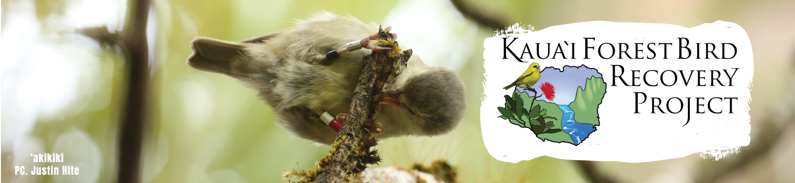
*akikiki